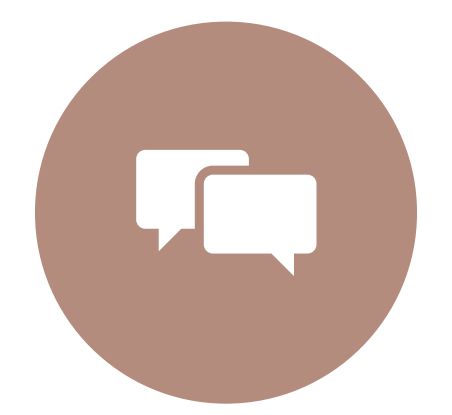
ENGAGE WITH OTHERS CONSISTENTLY